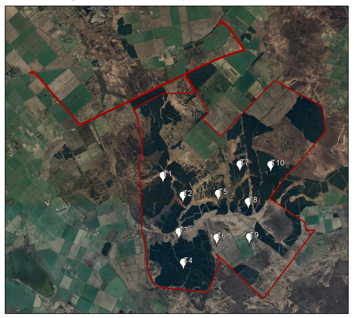
Figure 2 Proposed development layout

The locations of the proposed wind turbines are shown in Figure 2^2 below. The wind turbine coordinate and height details are presented in Appendix A.